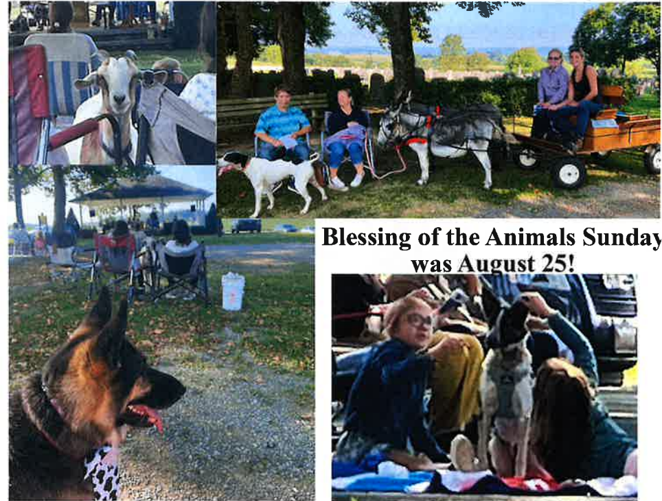
Blessing of the Animals Sunday was August 25!

Sunday School returns September 15 at 9 a.m. and Sunday Worship will be at 10 a.m.